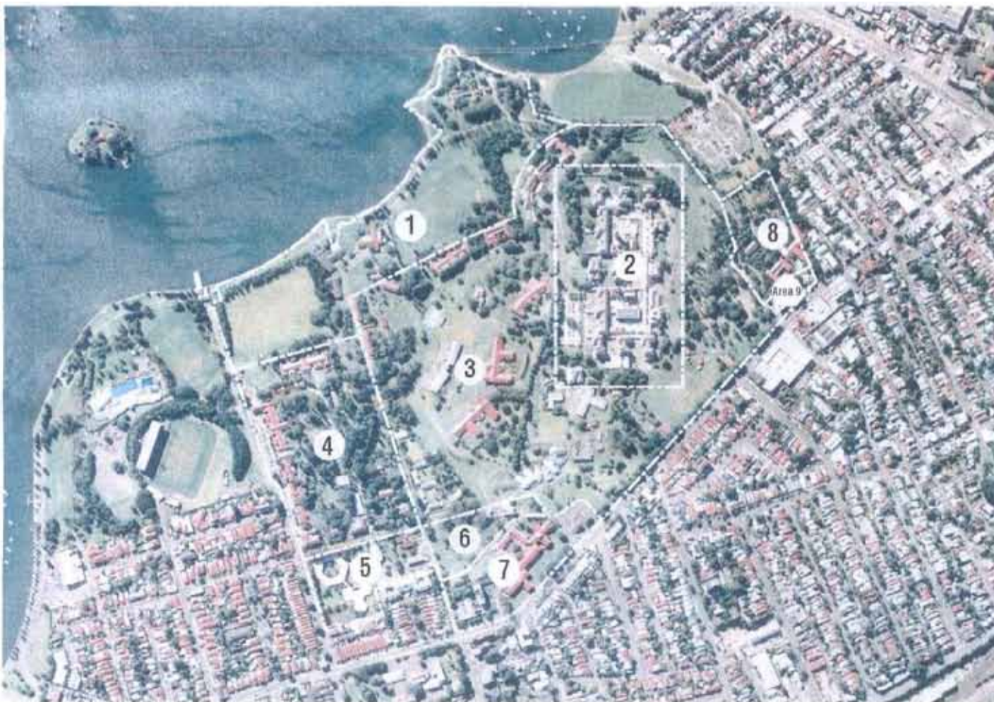
ABOVE. Figure no.1 precinct plan from NSW News Release, Wednesday 22 October 2008

There are currently three main providers of education on Callan Park, with the largest being Sydney College of Arts based in the Kirkbride Complex. Smaller teaching facilities are used by CCDWD for nursing