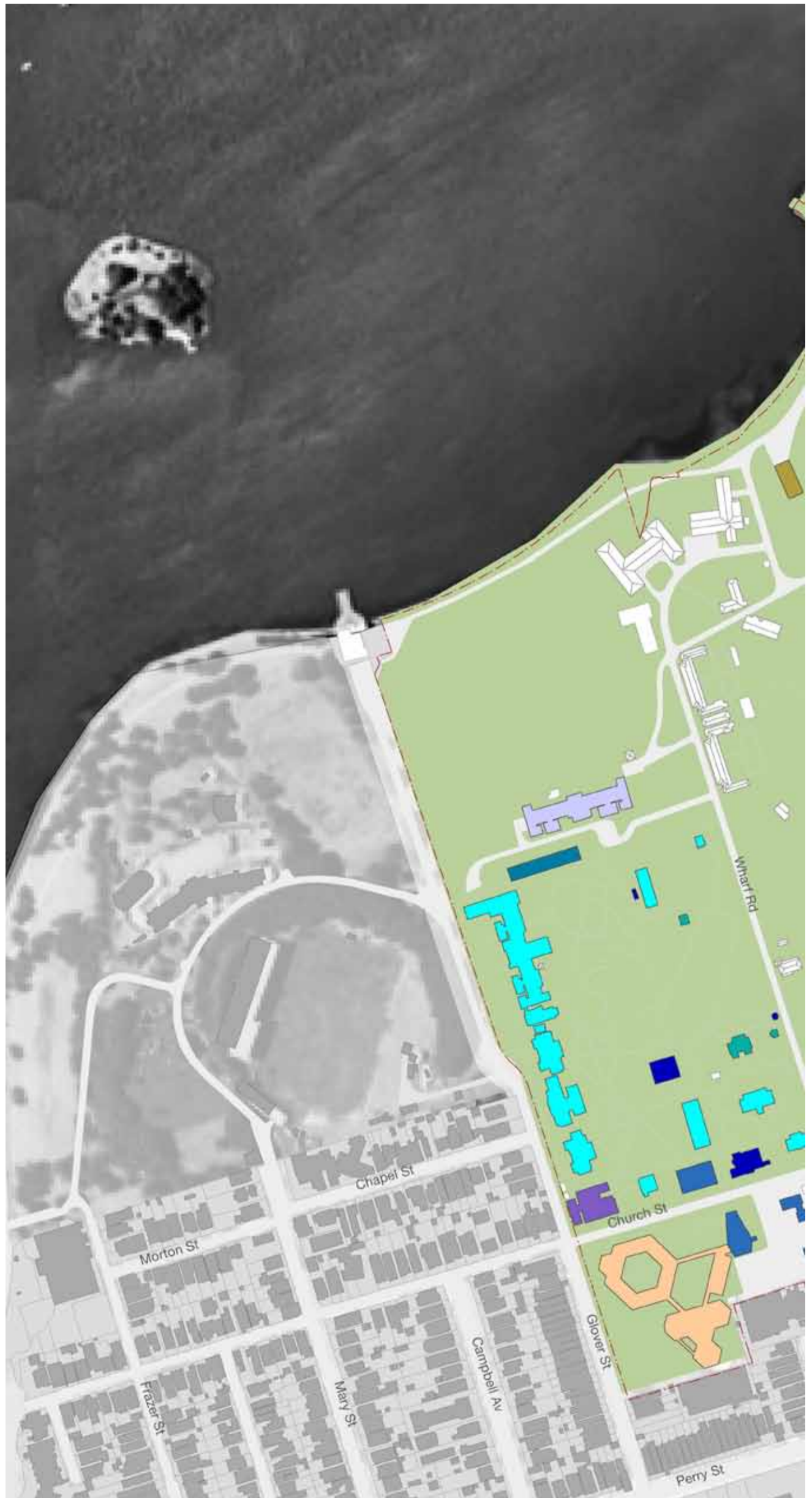
ABOVE. Figure no.2 building tenants diagram